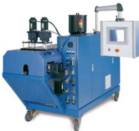
EX extruder system with Ultra FoamMix unit