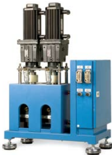
"Satellite" pump station with high-precision metering pumps and servo drives