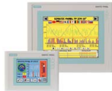
Siemens SPS with visual display of operating data and optional record of process data