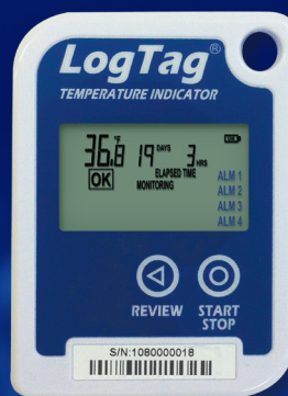
Monitoring Display LOAD OK