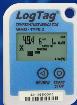
Monitoring Display LOAD REJECT